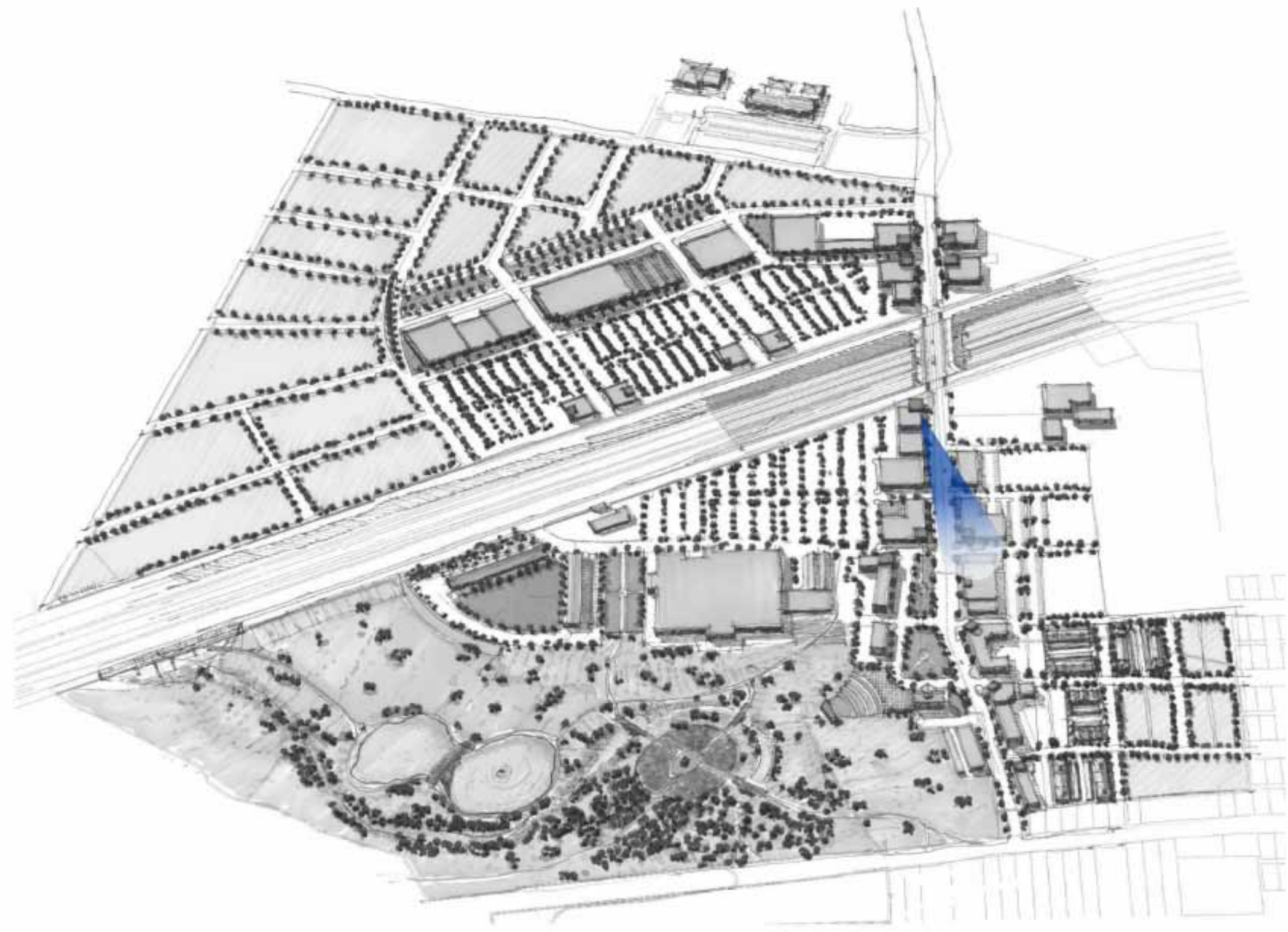
A view south along the Gregg Manor extension from near the new signature overpass over HWY 290.