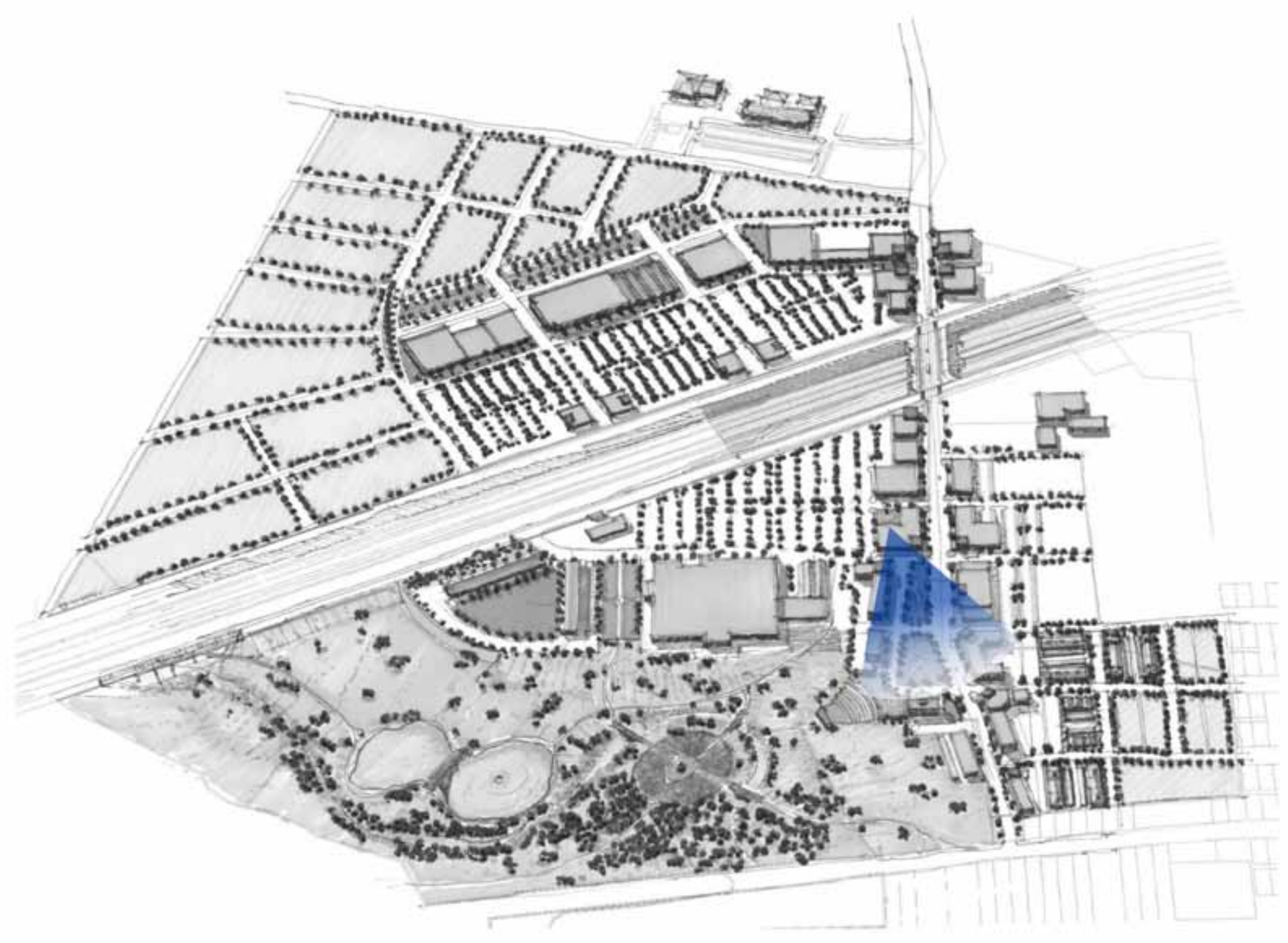
This view shows the new city hall, the town green, and the proposed retail development along Gregg Manor.